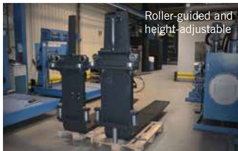
Roller-guided and height-adjustable

VETTER BigForks are individually manufactured according to customer requirements. From different suspensions to CROC ® anti-slip coatings on the fork blade or ATEX forks for hazardous areas to the integrated camera and sensor technology of the SmartFork ® product family - we develop your customised fork solution