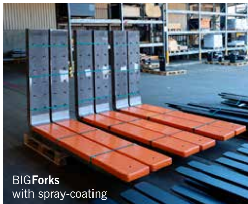
BIGForks with spray-coating