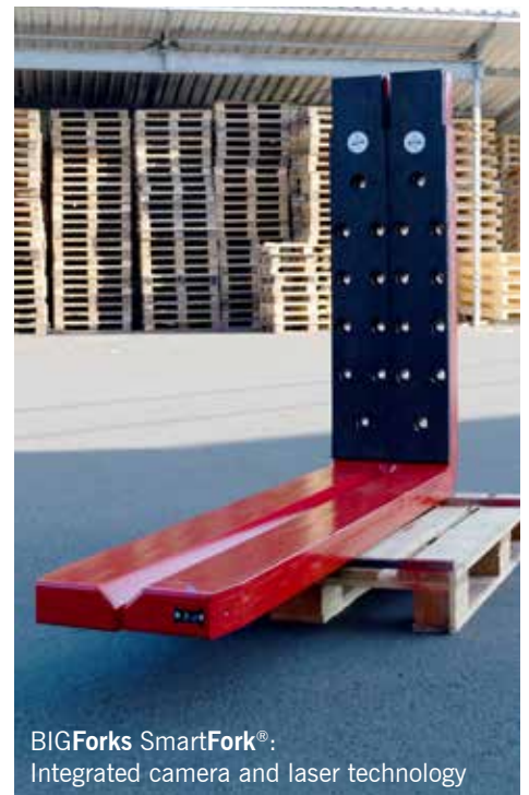
BIGForks SmartFork ® : Integrated camera and laser technology

The illustrations only represent the basic principles and do not constitute a contractual entitlement. © VETTER Industrie GmbH · 10/2023 · PI-62-US